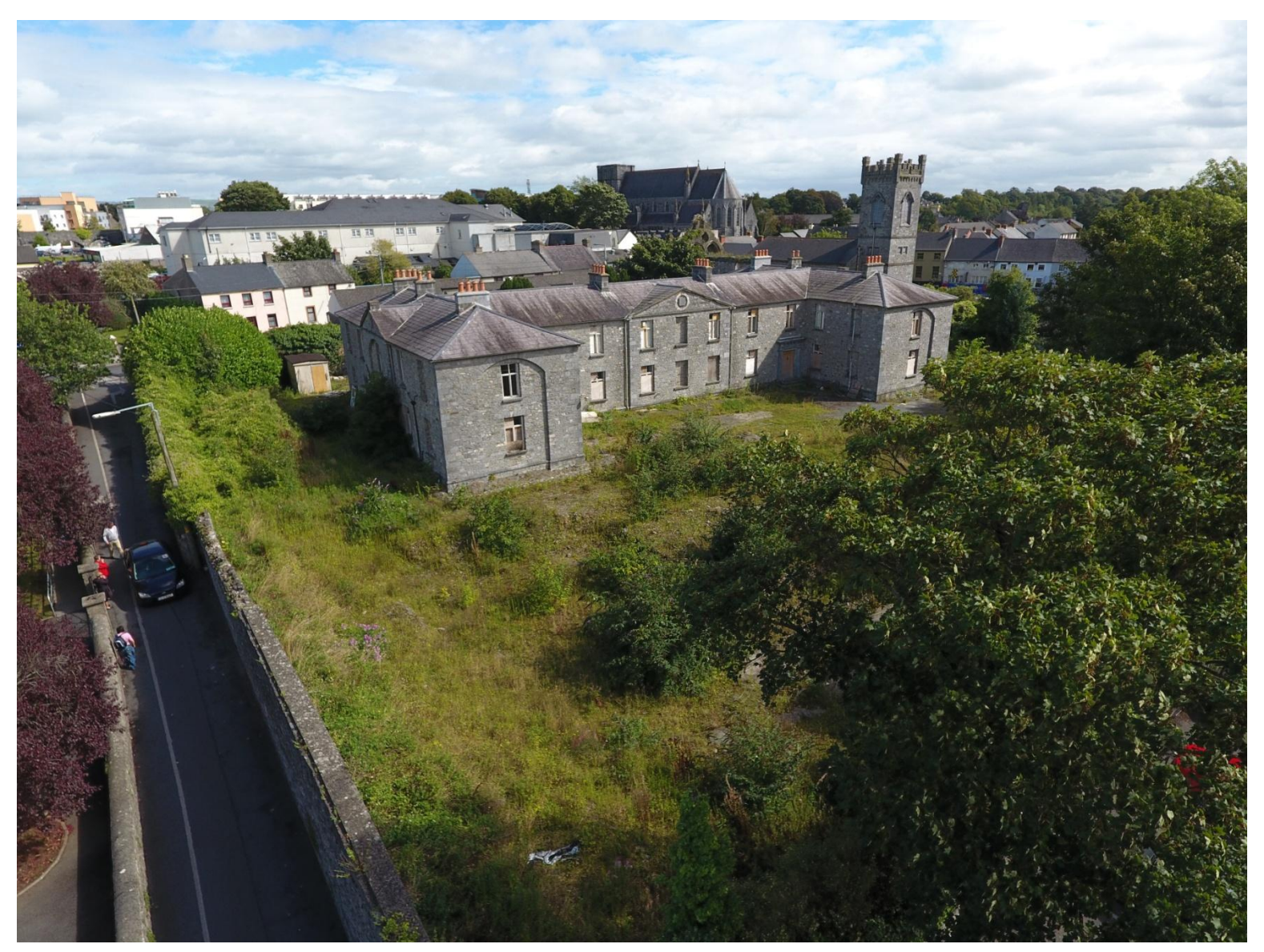
Evan's Home today- front façade