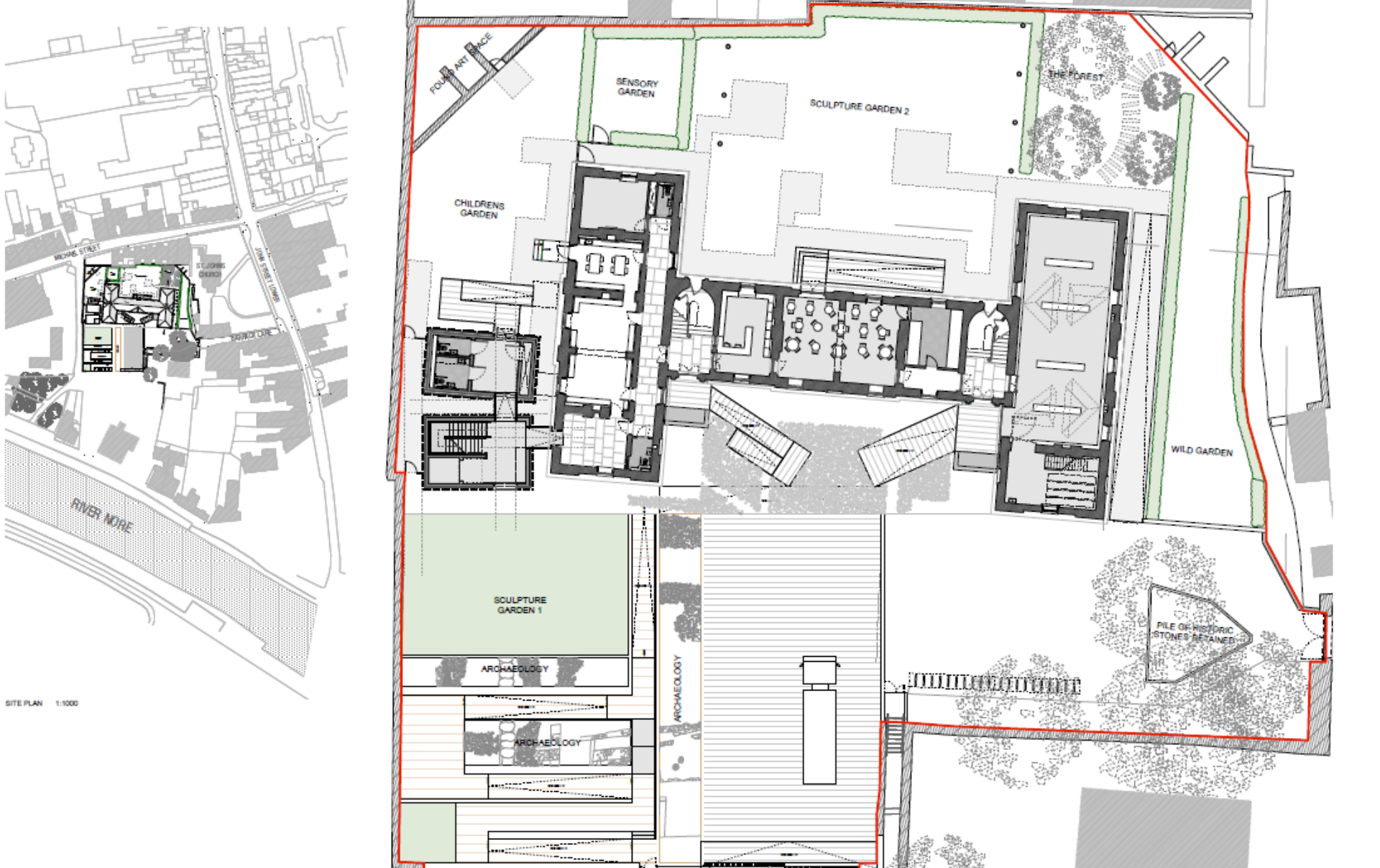
Plan of current proposal