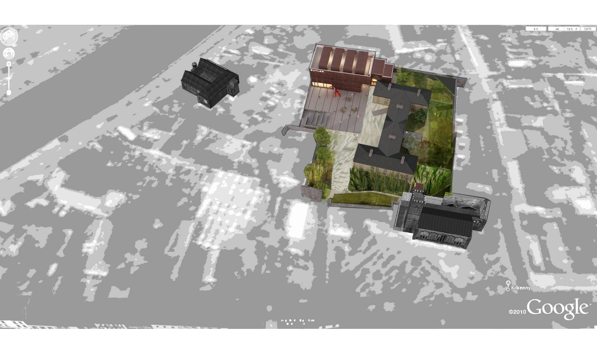
3D of 2011 proposal