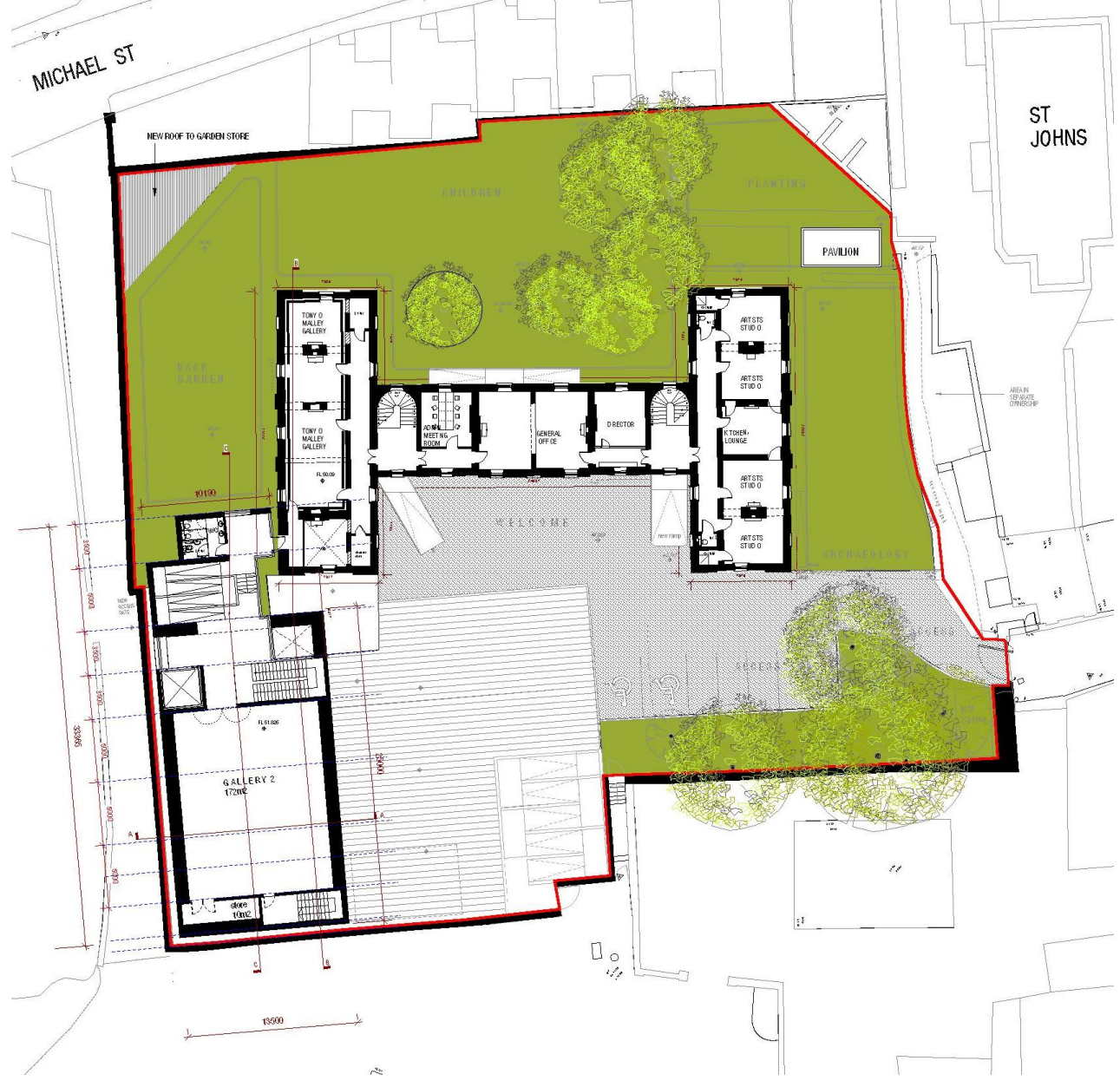
Plan of 2011 proposal