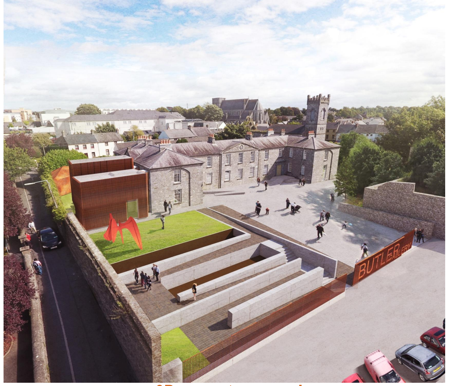
3D current proposal