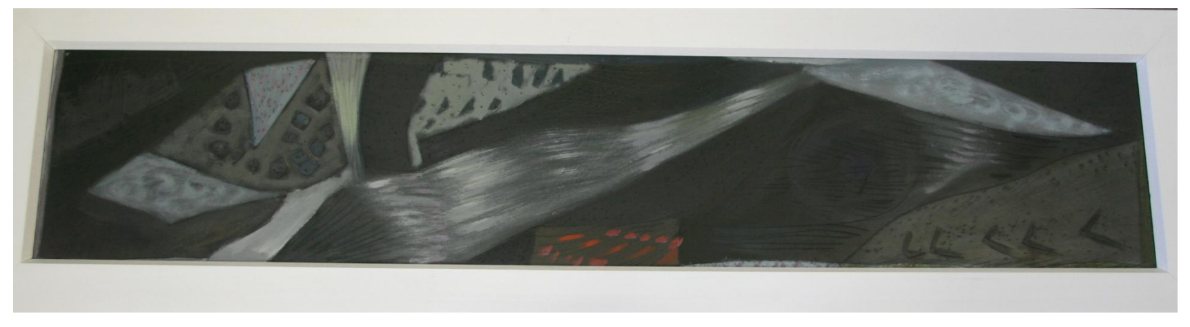
"Winter Crowscape" by Tony O'Malley Purchased in 2003 by Kilkenny County Council