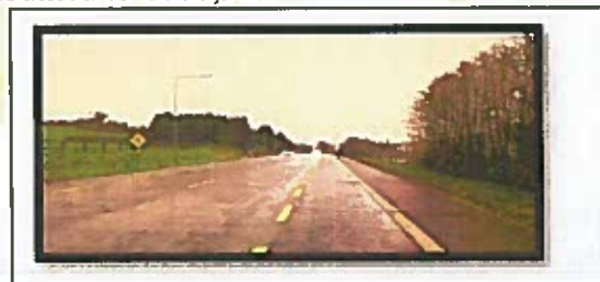
N78 Ballycomy December 2017

A 1.4 km overlay / inlay was completed in December at Ballycomy, Castlecomer, in December 2017, the works also included an extension of the existing footpath to the GAA Grounds, roadmarking and signage renewal and accommodation works. The cost of the scheme amounted to €668,903