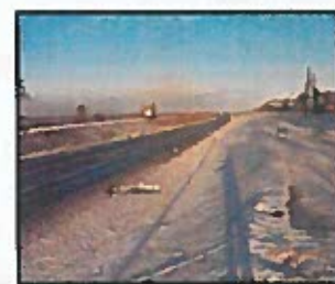
December 2016 - North of Brownstown Junction - December 2017