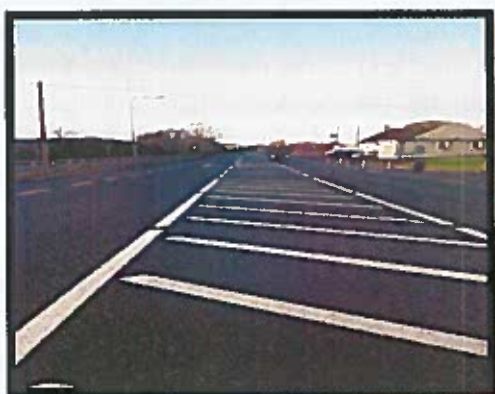
Completed works N24 Tirlough Bar Junction

turn lane at both the Tirlough Junction (Thatch Bar) and Portnahully Junction (Croke's Shop), improvements to the Aghlish Junction at Roadstone, roadmarking and signage renewal and accommodation works was completed in December 2017. The total cost of the scheme amounted to €709,000.