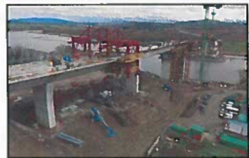
Barrow Bridge at Pink Rock – Full deck (including wing sections) formed on spans 1 and 2 to the left foreground. Wing traveller progressed towards the end of span 2.

The full circulatory roundabout will be operational for this phase which is anticipated to be in place until mid-June. The L-7513 Ballyverneen Road remains closed and the new realigned road is also anticipated to open in May. Also on the Kilkenny side, the Ballyverneen Overbridge and Glenmore Underbridge are well underway and the overbridge to carry the disused Waterford to New Ross rail line is also progressing.