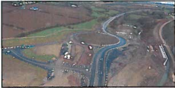
Temporary traffic management through Glenmore Roundabout. Works continuing on opposite side of roundabout in preparation for next phase in May. Construction of new Ballyverneen Road Overbridge and realignment visible to right of photo

The Elected Members of the Municipal District of Piltown and a number of Council Officials recently undertook a site visit of the project.