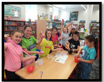
Phenomenal success with 57% increase in children completing our Summer Stars Reading Challenge – that's 1,988 children

We were blown away with the success of this years' Summer Reading Challenge for children. The challenge was completed by 1,988 children in Kilkenny - an increase of 57% on last years' initiative. The national summer reading challenge ran in libraries across Ireland, with children challenged to read 8 books each over the holidays to help maintain and improve reading skills. We ran Storytimes and craft workshops throughout the summer also, to encourage children to make return visits to our libraries, and help keep up momentum.